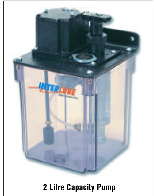
2 Litre Capacity Pump

Lubeplus 'E' has been manufactured using the highest engineering standards to give trouble free continuous and automatic operation.